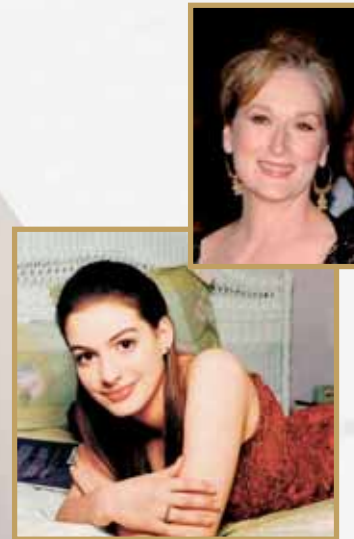
The Devil Wears Prada starring Anne Hathaway and Meryl Streep began filming in the fall