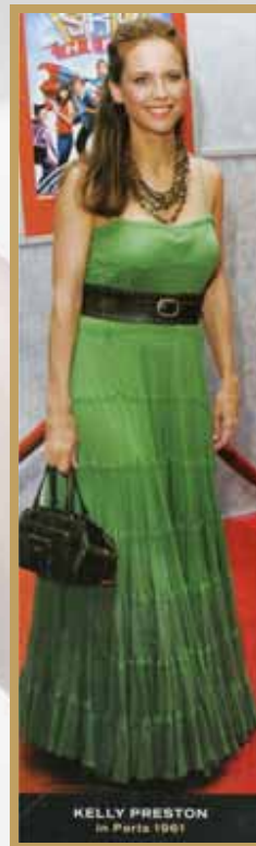
Kelly Preston in Ports 1961 at premiere of Sky High