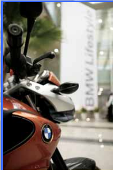
Images from BMW Lifestyle Fall/Winter fashion show in Beijing, October 2005