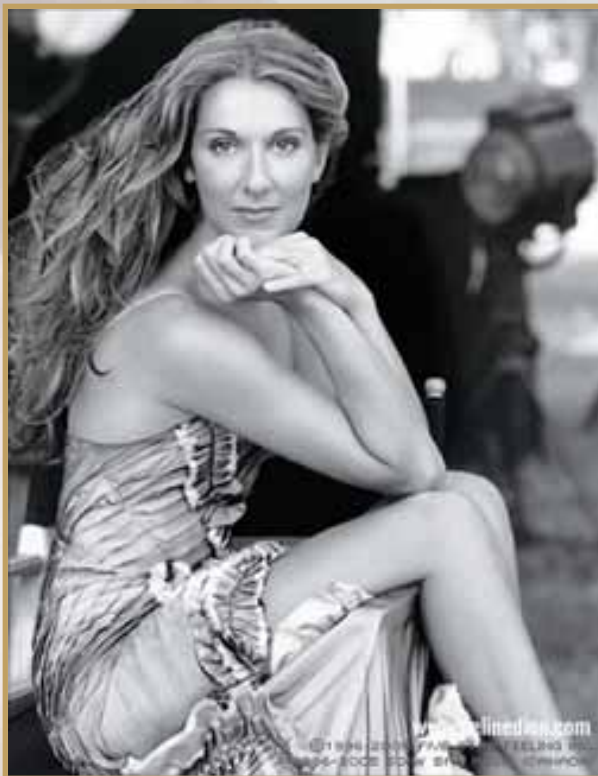
Celine Dion – ordered Fall/Winter 2005 dress after seeing the advertisement