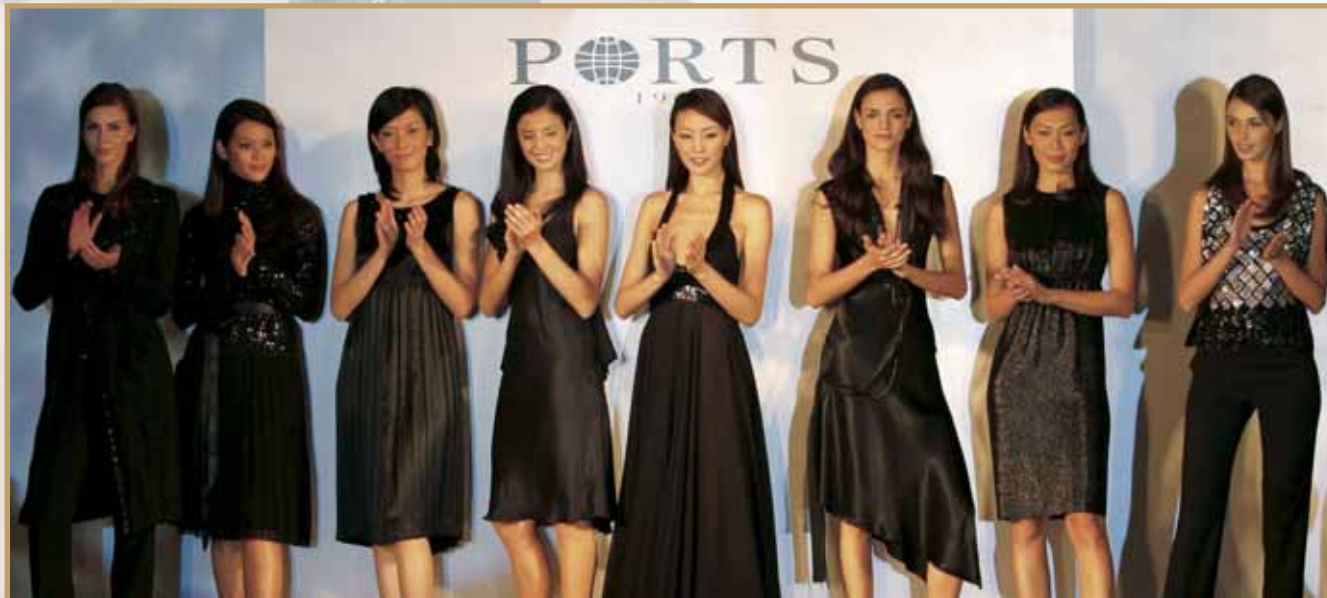
Ports 1961 fashion show, Shangri-La, Hong Kong